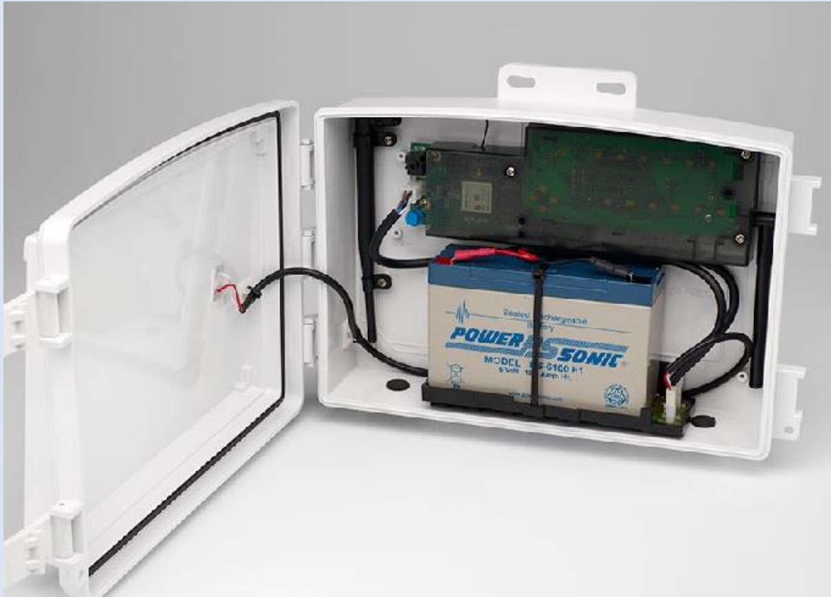
6622AU Wireless Vantage Connect

Please note a one off activation fee of $30.00 inc GST is required for this device.